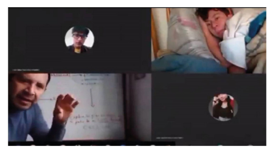
Figura 4. Sleeping student in a virtual class.[27]

Although the cost of the logistics of a virtual education is important, the changes in the perception of education and the effects on university students are issues that should not be ignored. The journalist [26] writes about the anguish and antipathy towards virtual classes in the vast majority of students. As arguments they exposed problems of connection, participatory difficulty and distancing from the teacher [26].