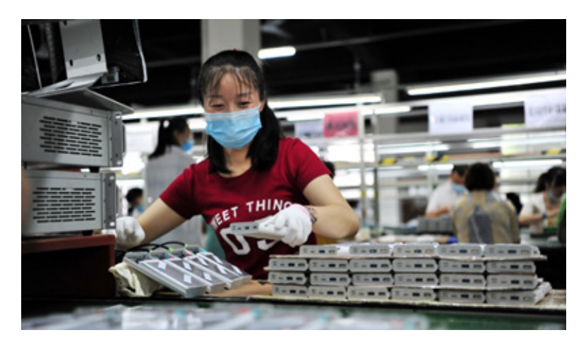
Figura 1. SMEs in the world. A growing business. [15]

You should be wary of magic formulas for success, no matter how attractive and professional the alternatives are. Bill Gates insisted that finding ourselves surrounded by information does not mean that we are using it properly [14].